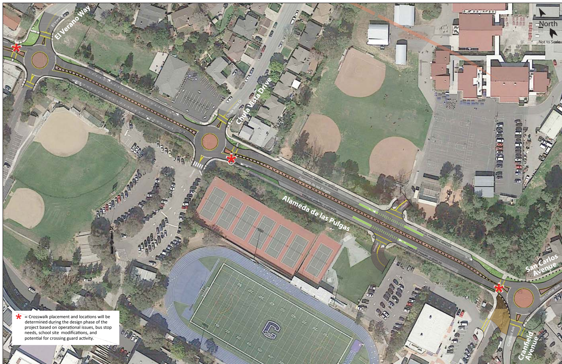
EXHIBIT 3A - Alameda de las Pulgas/San Carlos Avenue Corridor Plan