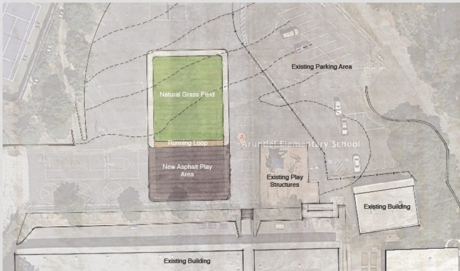
Arundel School Play Area Temporary Configuration