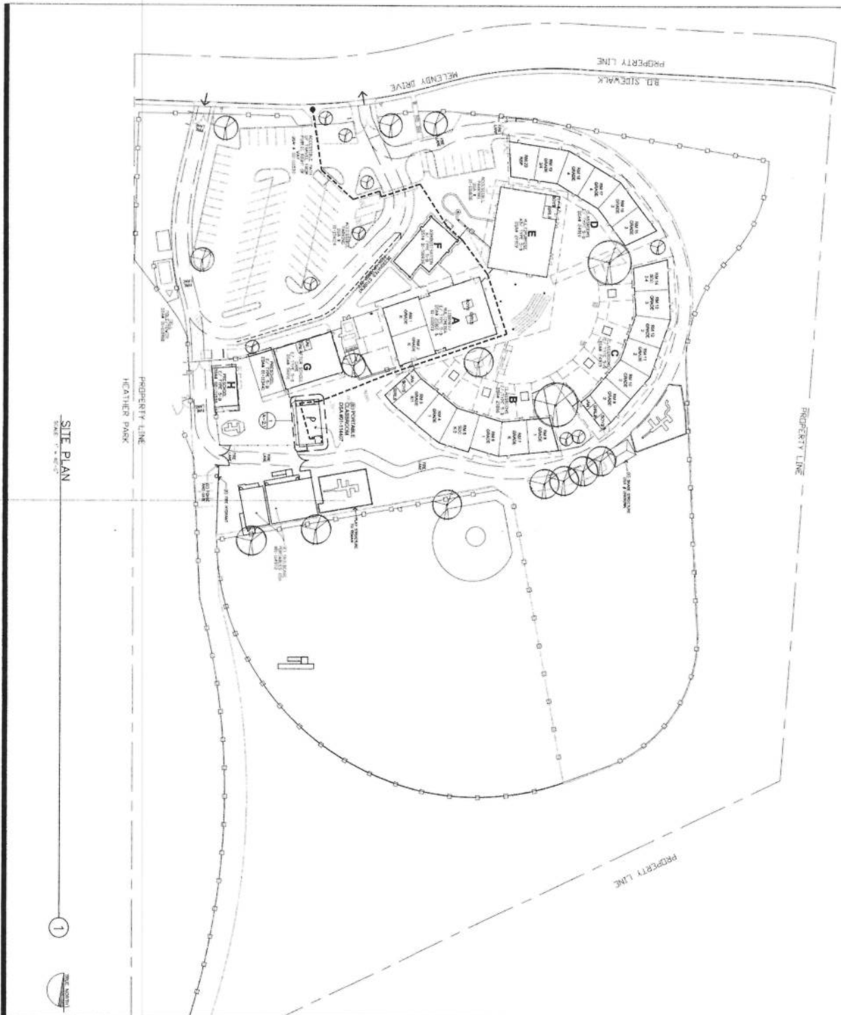
SITE PLAN SCALE: 1" = 20'-0"